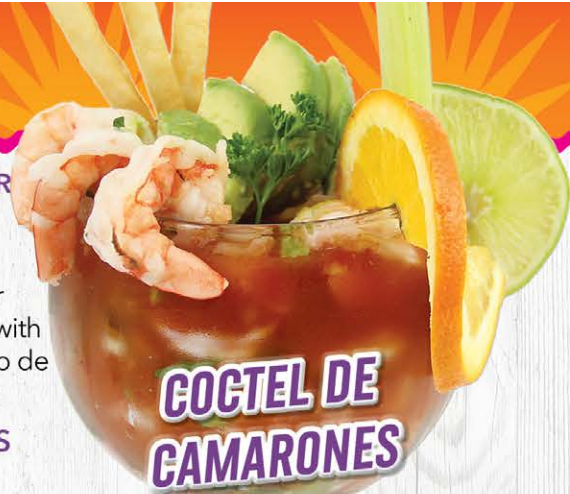
COCTEL DE CAMARONES