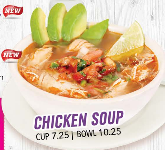
CHICKEN SOUP CUP 7.25 | BOWL 10.25